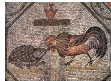
The Pilgrim's Credential Souvenir Aquileia Souvenir at the Basilica Aquileia, mosaic (north hall)